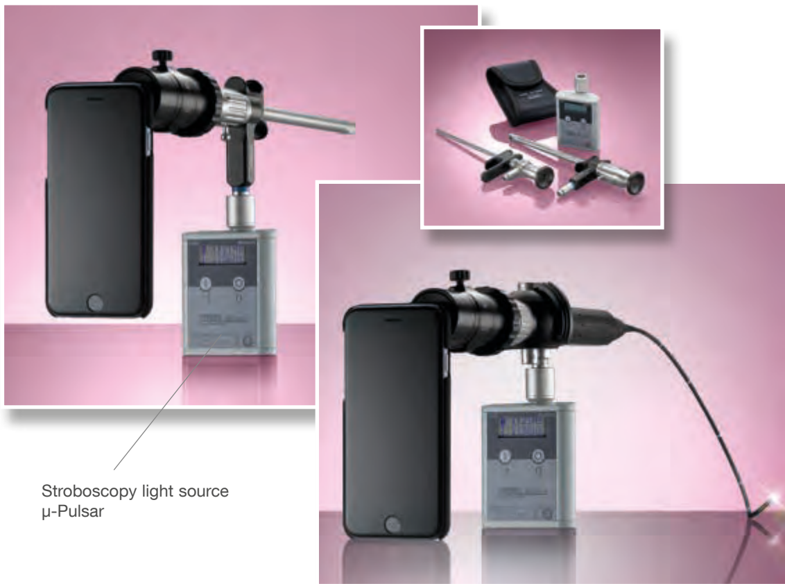
Stroboscopy light source \mu -Pulsar

In addition to use with a standard light source, the SMART SCOPE adaptor can also be connected to the \mu -Pulsar miniature stroboscopy light source in conjunction with laryngoscopes. This facilitates visualization and documentation for stroboscopy treatments. The combination of these two products offers the practice a cost-effective, mobile and comprehensive solution for stroboscopy.