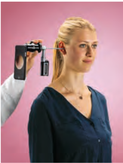
Rigid endoscope in otoscopy

Both rigid and flexible endoscopes are compatible with the SMART SCOPE adaptor. It is therefore suitable for various indications, particularly in the ENT field.