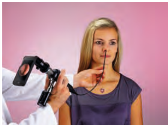
Flexible endoscope in rhino-laryngoscopy

KARL STORZ offers the SMART SCOPE adaptor for various smartphone models. You will also need an endoscope and a light source.